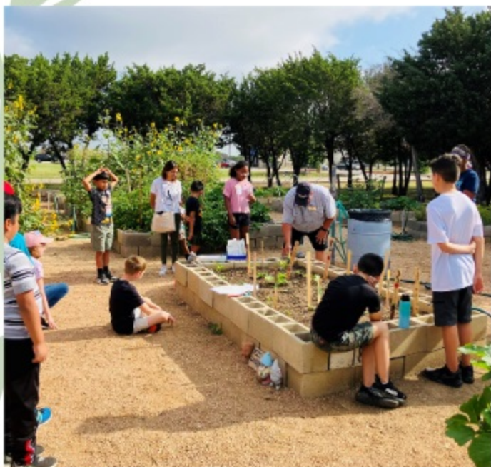
Community Garden: Programming supplies, plants, and tools

Outdoor Education & Science Expo: Giveaways, seeds, and raffle prizes