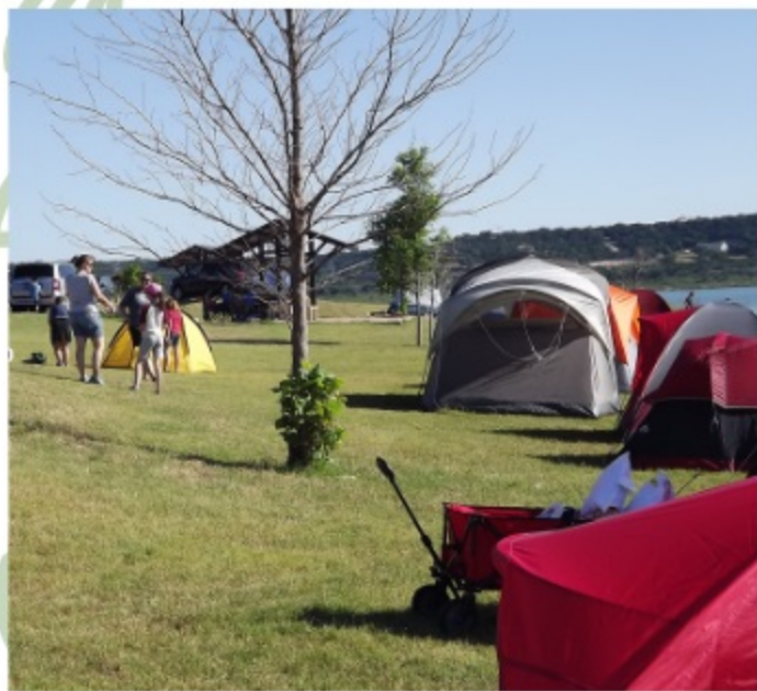
Family Campout: Meals and giveaways