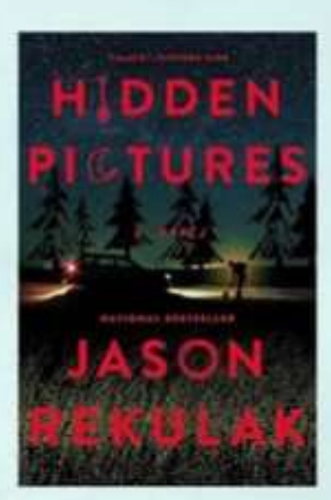
Thursday, July 17