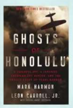
Thursday, June 26